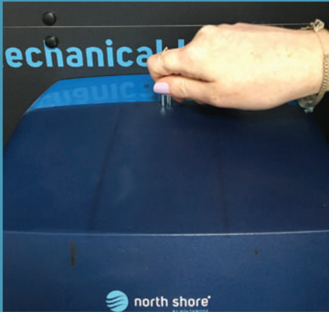
Use the key to open the dispenser