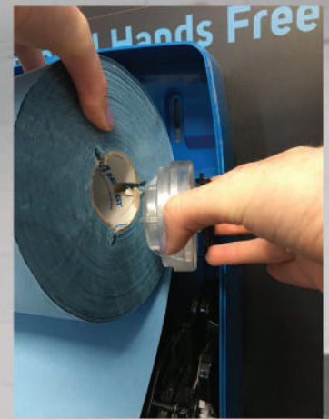
Line up the Y-notch up with the shape of the spindle. *Note - Paper should feed from the back*