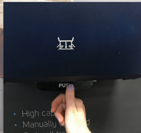
Close the dispenser & push on the 'Push bar' until paper dispenses